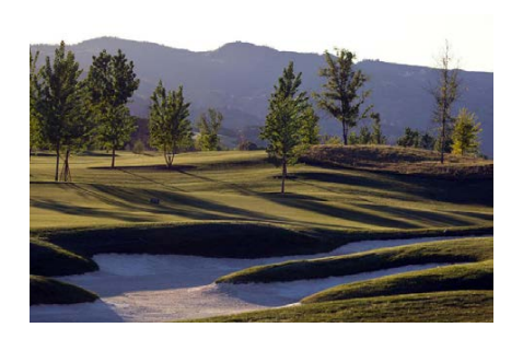
SAVE THE DATE! 4th Annual CSLEA CPPS Foundation Golf Tournament