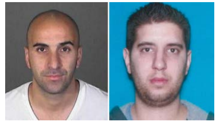
Two Men Charged With Scamming L-A Area Senior Citizens

Two Los Angeles area men are sitting in jail with bail set higher than a million dollars each after they allegedly scammed dozens of elderly victims over a two year period to the tune of nearly $500,000.