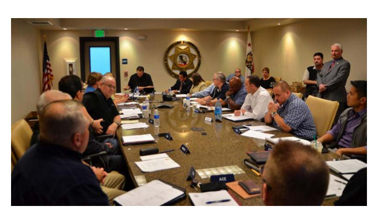
CSLEA Board Member Quarterly Meeting

Full-dues paying members receive an enormous benefit over fair-share members which is evident in this <u>MEMBER vs. NON-MEMBER</u>