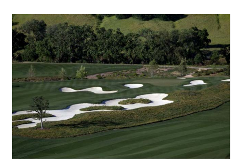
4th Annual CSLEA CPPS Foundation Golf Tournament

The CSLEA Consumer Protection & Public Safety Foundation Golf Tournament brings together California's top public safety association leaders, lawmakers, lobbyists, attorneys and members for an exciting day of golf, food, prizes and fun.