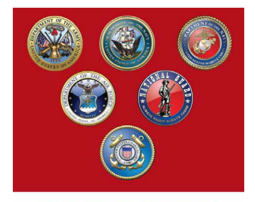
IF YOU SERVED, YOU EARNED

California is home to nearly 1.8 million military veterans, sadly, only about 20% of them are collecting the benefits and services they earned protecting America.