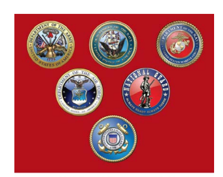
IF YOU SERVED, YOU EARNED

California is home to nearly 1.8 million military veterans, sadly, only about 20% of them are collecting the benefits and services they earned protecting America.