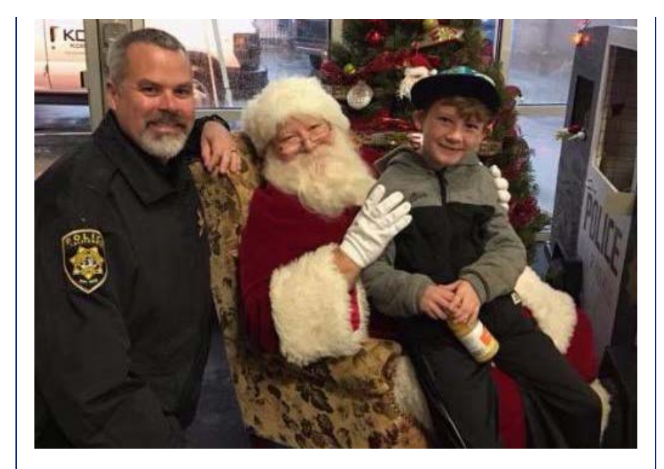
ROSEVILLE - On December 10, 2016, law enforcement officers from nine agencies in Placer County spent the morning with 89 well deserving children chosen to participate in the annual Shop With a Cop program.