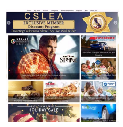
CSLEA Exclusive Member Discounts Program