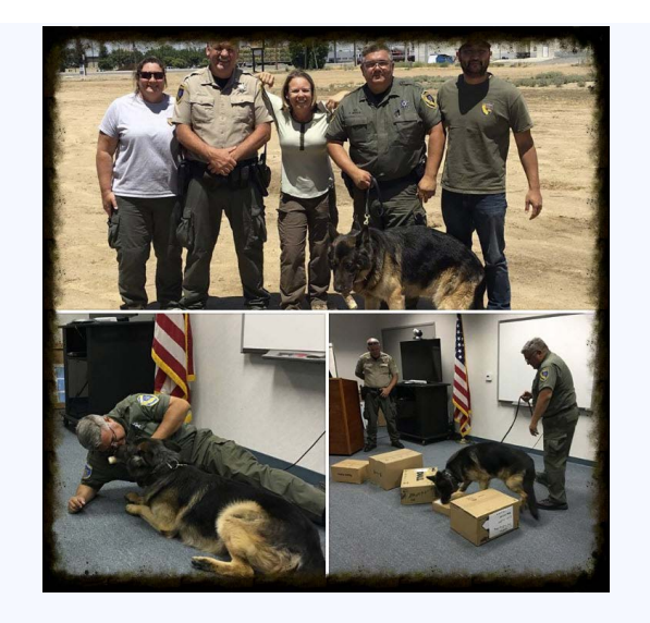
What You May Have Missed on Instagram