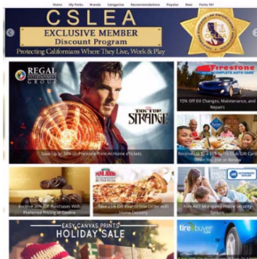
CSLEA Exclusive Member Discounts Program