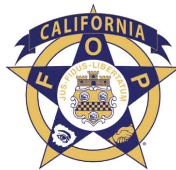
FOP Lodge #77 Membership for Retirees and Retired Annuitants