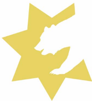
CSLEA Foundation Consumer Protection & Public Safety